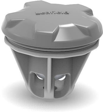
C7 Base Spanner For C7 Installation Part Number: C166051

The C7 inflatable boat valve is designed for use in demanding applications such as Military and Commercial RIBs, River rafts and Inflatable Boats.