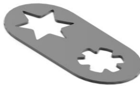
C7 Top Spanner For C7 Installation Part Number: C16603