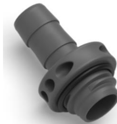
Screw-In Hose Adaptor Assembly With Spring Part Number For Ø16mm I.D Hose: 1312003 Part Number For Ø20mm I.D Hose: 1312004

Refer: Installation Sheet for C7 Inflation/ Deflation Valve Document Number: 16623 Refer: C7 User Manual Document Number: M-08-IS-1C7