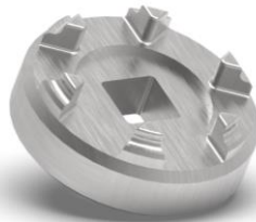
C7 Base Spanner For C7 Installation Part Number: B16604